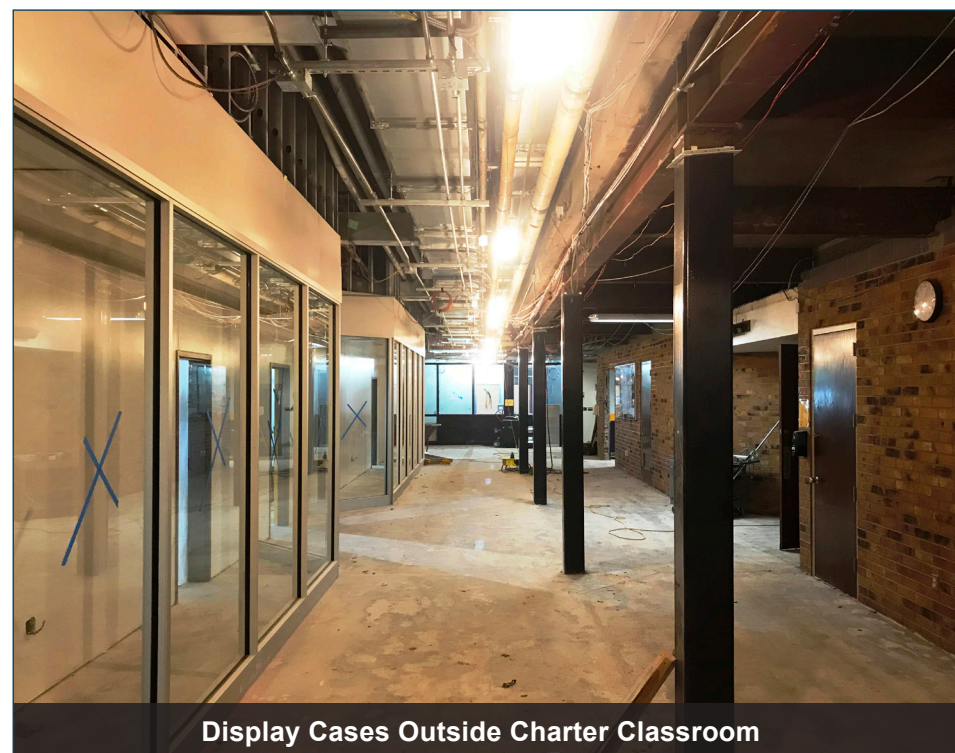
Display Cases Outside Charter Classroom